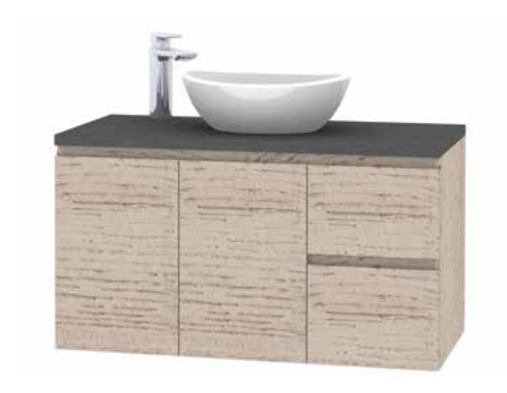
Mont Albert 900 wall hung vanity, in Light Ash, Concrete Stone top, Organic basin, RHS drawers with a 10:00 taphole