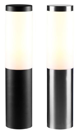
DECK LIGHT - LARGE / SMALL