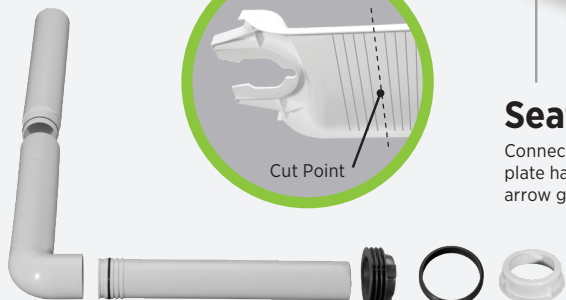
Flush Pipe Kit