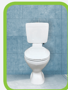
Low Level with Link

Wall fixing bracket adjusts 11mm for easy alignment