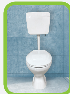
Low - Mid Level