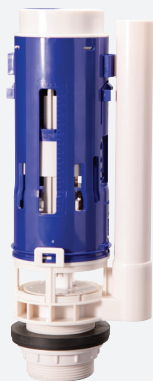
Outlet Valve 560AU02