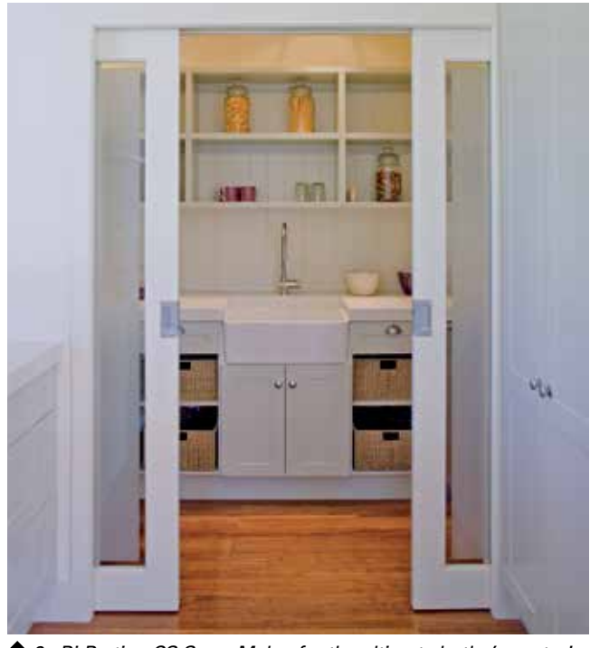
♠ 2 - Bi-Parting CS SpaceMaker for the ultimate butler's pantry!