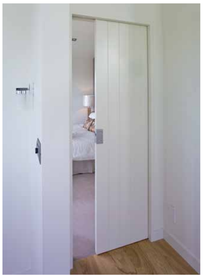
1 1 - Single entry door into a bedroom.