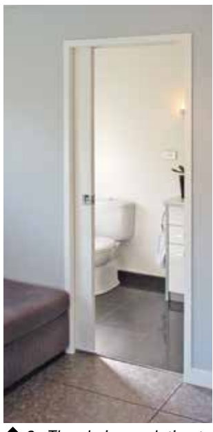
♠ 3 - The obvious solution to en suites short on space.

The CS SpaceMaker is a practical solution for those areas where there is not enough space for a pre-hung door, such as en suites, wardrobes and hallway cupboards.