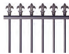
5. SPEAR BOUNDARY