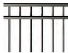
17. DTR - ALL UP