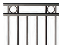
10. DTR WITH RINGS