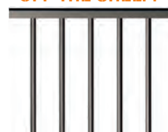
1. FLAT TOP POOL & BOUNDARY