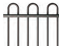
2. LOOP POOL