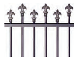
6. HI-LO SPEAR