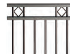
12. DTR WITH DIAMONDS