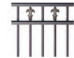
8. DTR WITH SPEAR