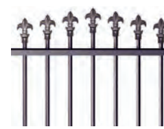
7. ARCHED SPEAR