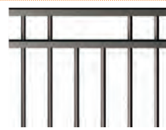
9. DTR - 2UP 2DOWN