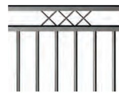
15. DTR CROSSES CONCERTINA