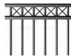
19. DTR ALL CROSSES