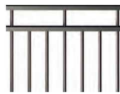
13. DTR - 1UP 2DOWN