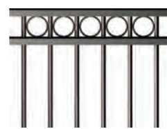
18. DTR ALL RINGS