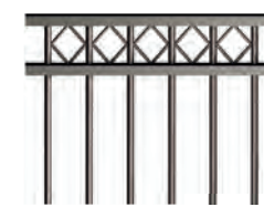
20. DTR ALL DIAMONDS