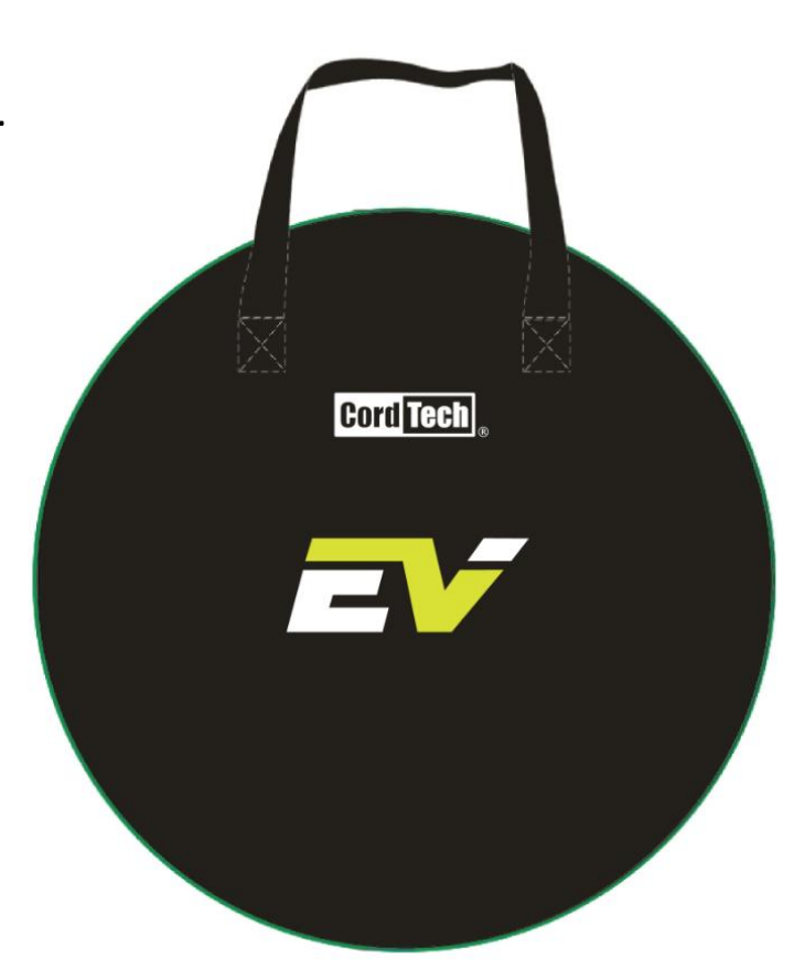
CEVB – Storage Bag (Sold Separately)